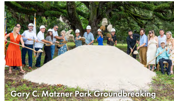
Gary C. Matzner Park Groundbreaking