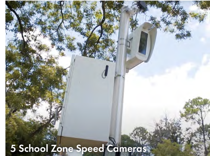
5 School Zone Speed Cameras