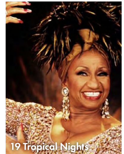
19 Tropical Nights