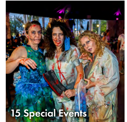
15 Special Events